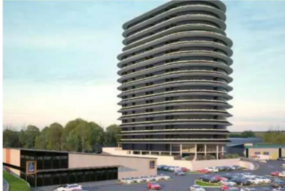
The Beacon, a 17-storey tower on Whiteleaf Road, has been designed to generate enough energy to power most of the buildings requirements

Published: 17:23 Tuesday 22 November 2016