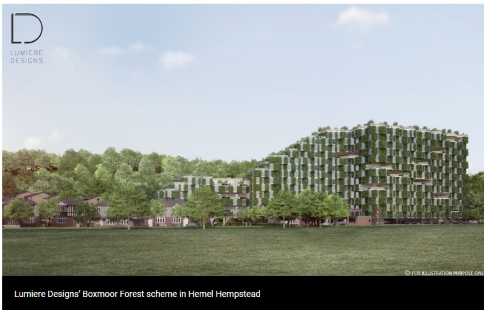
Lumiere Designs' Boxmoor Forest scheme in Hemel Hempstead